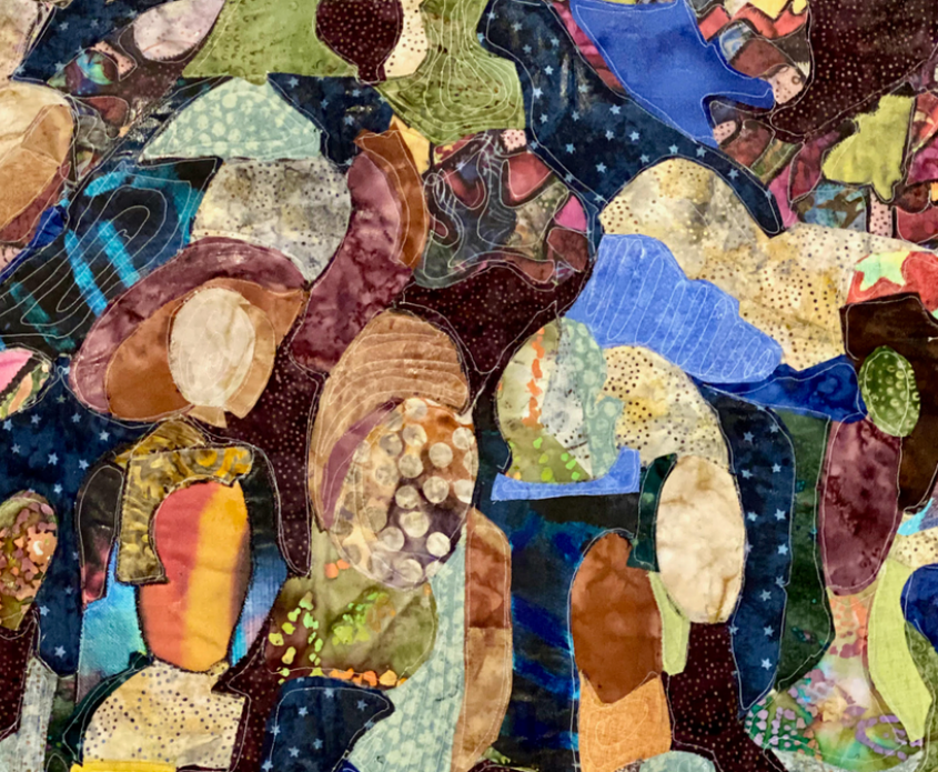
Faces in the Crowd